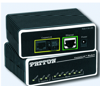
Patton CopperLink™ "King of Ethernet Extenders"

Have you seen? For a monthly fee, members of the celebrity's online club, can go see today — live and real-time — what their hero used to see from his bedroom