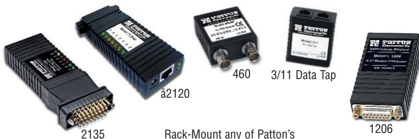
Rack-Mount any of Patton's MicroPak Products

Unique bracket-and-groove system fastens the MicroPak securely into the panel