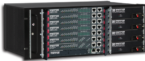
ForeFront with 3101RC