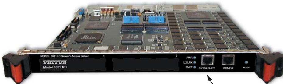
Front panel 10/100 Ethernet port

Special Rates Available Call for Details