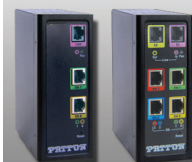
Ruggedized CL1314R & MDE