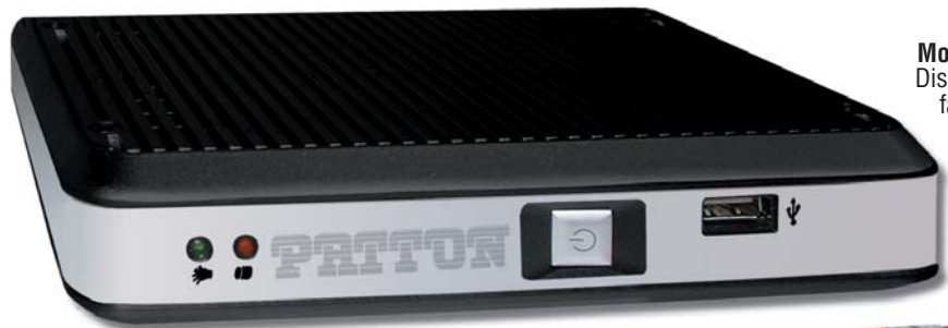
Model 6073 Diskless and fan-less