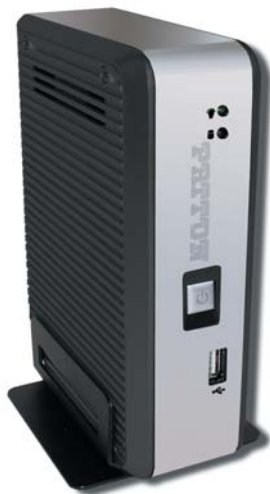
Model 6075 Fan-less with 40GB hard disk

Visit www.patton.com for more information.