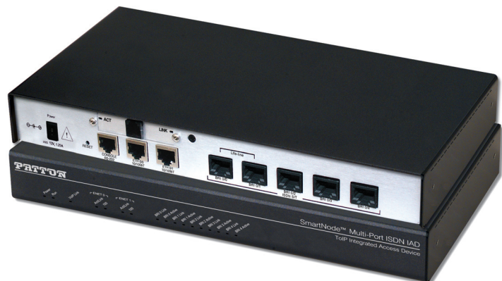
SmartNode 4650 with G.SHDSL.bis

Visit www.patton.com for more information.