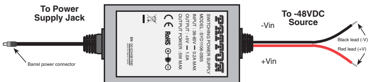
Figure 1. DC Power Supply

The 36-60 VDC DC to DC adapter is supplied with the DC version of the Model 3088A/1. The black and red leads plug into a DC source (nominal 48VDC) and the barrel power connector plugs into the barrel power supply jack on the 3088A/1. (See figure 1).