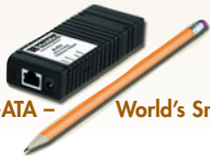
Patton M-ATA – World's Smallest Analog Telephone Adapter!