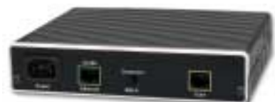
Model 2603—T1/E1 Interface