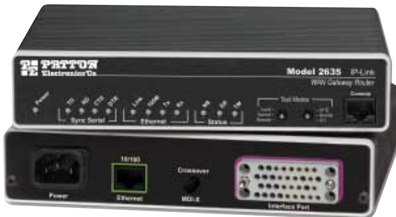
IPLink Gateway Router