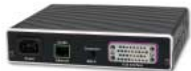
Model 2635—V.35 Interface