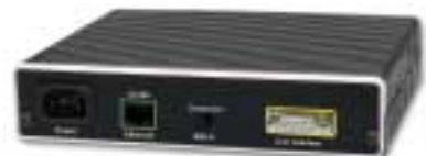
Model 2621—X.21 Interface