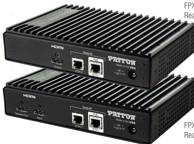
FPX6000R Rear View