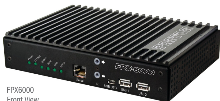
FPX6000 Front View