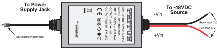
Figure 1. DC Power Supply

The 36-60 VDC DC to DC adapter is supplied with the DC version of the Model 3088. The black and red leads plug into a DC source (nominal 48VDC) and the barrel power connector plugs into the barrel power supply jack on the 3088. (See figure 1 ).